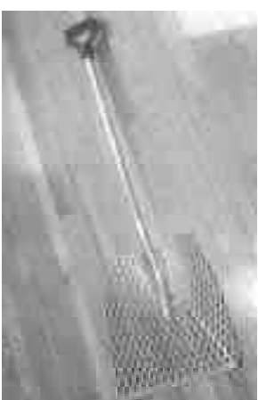
Lightweight shovel has 3/4-in. long diamond-shaped holes in it.

Contact: FARM SHOW Followup, The W.F. Valentine Co., 7633 Quackenbush Road, Reading, Mich. 49274 (ph 800 331-6728 or 517 283-3143).