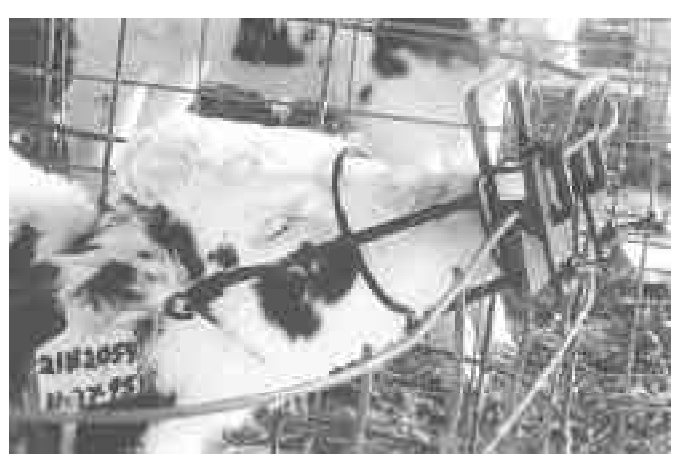
Calf's nose is guided into a steel ring welded to a spring-loaded clamp that fastens to wire cattle panels, etc. You then slip an attached chain behind calf's ears and hook it.

Contact: FARM SHOW Followup, Shoof International Ltd., Private Box 522, Cambridge, New Zealand (ph 64 7 827 3902).