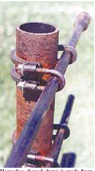
Horseshoe-shaped clamp is made from 3/8-in. sq. steel bar and allows steel rods to be secured to fence posts made from common 2 7/8-in, dia, round tubing

Dzen also makes portable grain storage bags and vinyl covers for auger motors, aeration fans, seeders and chemical applicators, etc. (Vol. 19, No. 4). "One of my customers asked me if I could sew a vinvl