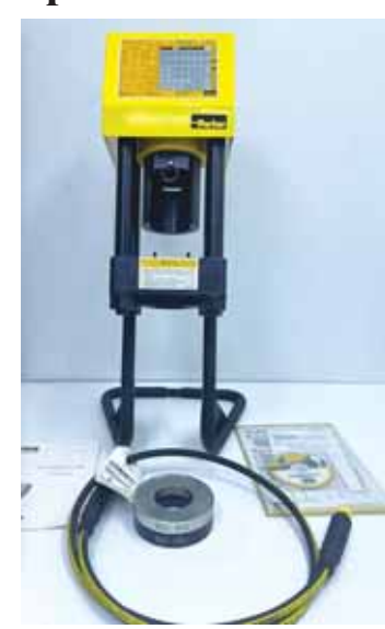
Portable crimper weighs just 55 lbs. and can be set up where repairs are needed.

The Parkrimp family of crimping machines