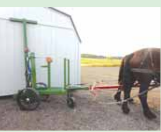
Shed mover has a 12,000-lb. lifting capacity and comes with either a tractor hitch or a tongue for horse towing.

from scratch in their shop and ships them across North America.