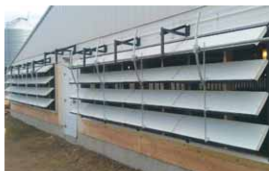
Their unique rack and pinion drives are fitted with limit switches providing the exact torque and speed to properly operate the shutters.

The microchipping program is working so well that the Ag Department is looking at ways to prevent other valuable farm items