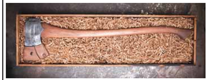
Dyck forges Hudson Bay-style axes and hatchets and sells them through his website.

The store will also clean, bead blast, and soak old carburetors and rebuild them with new parts as required, including setting the