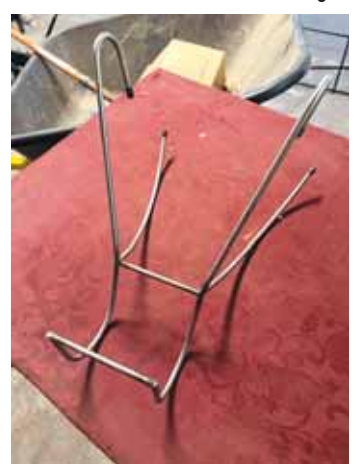
Drop a piglet in above the rear bar, pull the back legs under the front bar and it's secured. Once upside down in the Nut Boss, Blake notes that the pigs don't squeal.

Making the tool out of stainless steel adds to the cost, but Blake feels the added expense