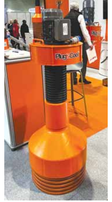
A combination of pedestals and grain cooling fans cool crops quickly to prevent insects, conserve quality, reduce waste, and meet crop assurance requirements.

The UK company ships all over the world. Bundled kits start at $900.