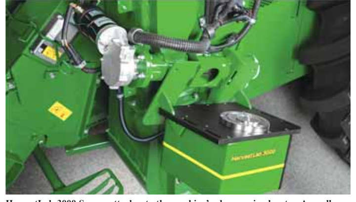
HarvestLab 3000 Sensor attaches to the combine's clean grain elevator. A small motor drives an auger that pushes grain past the near-infrared sensor as the combine is harvesting.

Contact: FARM SHOW Followup, American Hotbox, 703 S. Aurora St., Eldon, Mo. 65026 (ph 573-375-1111; Carl@ americanhotbox.com; www.americanhotbox. com/product/the-nut-boss-small-version/).