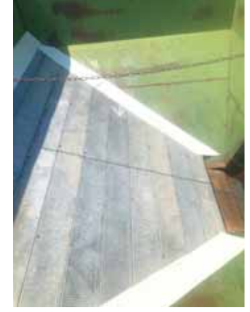
Aeration flooring used as flooring in a gravity box wagon helps dry down seed.

"We now cut the legs, so the flooring is around 2 in. off the wagon floor," says Ravenkamp. "We've used them for lots of small seed batches like clover and alfalfa.