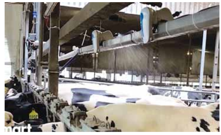
Smart sensors monitor the temperature and humidity in the area of the cow to be sure that each soak is the right amount.

Contact: FARM SHOW Followup, Tony Wendler, Farm Shop Mfg., 1042 570 Ave., Armstrong, Iowa 50514 (ph 712-520-6051; sales@FarmShopMfg.com; www.farmshopmfg.com).