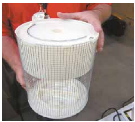
Mouse climbs up trap's mesh sides and jumps through an entrance hole at top. To release the mouse you remove a plastic tray at bottom.

You can watch mice getting caught in the trap on youtube by going to www.best-