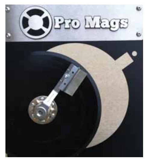
Universal scraper bolts onto the axle of any planter's opening disc.

For the ultimate performance in scrapers, Pro Mags scraper blades are now available with tungsten carbide. "We use revolutionary technology to make a uni-body blade for the ultimate cleaning and extended wear," says Hesla. "The uni-body blade provides a smooth, contiguous surface without the need for bulky aluminum housings to hold a carbide strip which provides a clean 'shaving' of the opener disc rather than a squared 'pushing' action. Tungsten carbide scraper blades are available for both planter and Deere air seeder scraper kits."