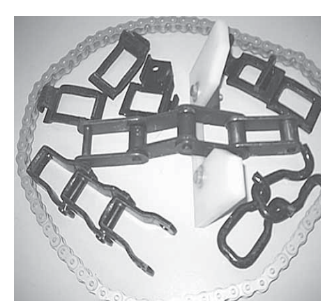
Customers can order chains from the website, from a catalog, or over the phone.