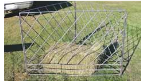
easily for transport.

ber and rebar, the 6 or 12-ft. long grain feeders look like large planter boxes and are suspended off the ground by a pair of welded-together rebar frames that serve as leg stands. Extra wide bases on the frames help keep animals from tipping the feeder over.