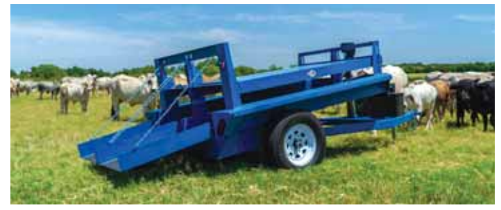
Protein tubs ride in channels which lower to the ground for delivery. Metal covers the trailer compartment to keep tubs dry in rainy conditions.