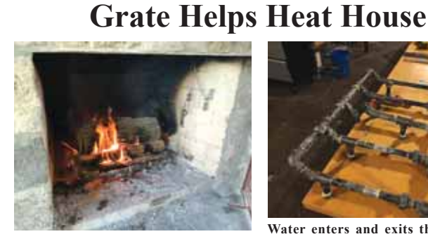
Fireplace grate made from black pipe takes heat from upstairs and sends it down to Reinholm's basement using a small 3-speed recirculating pump.

Contact: FARM SHOW Followup, Cone Guard, 11111 Lockwood Rd., Sherwood, Ohio 43556 (ph 419 899-3579; www.coneguard.com).