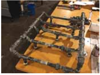
Water enters and exits the firewoodholding grate through separate outlets at the front. Heated water is pumped down through PEX pipe to a 12-in. sq. "water to air" heat exchanger in basement (below).