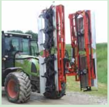
ETR Topper rotors are fitted with 4 boomerang-shaped blades.

Contact: FARM SHOW Followup, W-Cult Oy, Luvian Kirkkotie 30, 29100 Luvia, Satakunta, Finland (ph 358 400 715 728; markku.weckman@w-cult.fi; www.w-cult. 6)