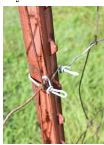
Drill is used to bend prongs one at a time around fence wire. "It's safe to use and works fast," says Ajit Rose.

He says the key was coming up with a clip with just the right bend length and angle to tie the clip to the wire perfectly tight. "It works fast - each clip can be tied in less than 10 seconds from start to finish," says Rose.