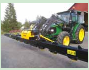
W-Cutter uses electric motor-driven rotors equipped with thin steel chains.

Contact: FARM SHOW Followup, Bionalan, 31 Grande Rue, 08210 Euilly Et Lombut France (ph 33 3 24 22 20 60; info@ bionalan.fr; www.bionalan.fr/en/).