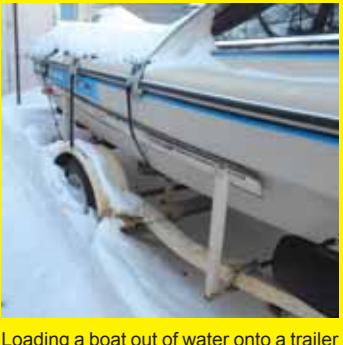
can be tricky, especially when high winds can cause the boat to bob around. To

The loader can raise the scaffold up to 12 ft. high. (Jack Agnew, 4605 Fox Chase Run, Gum Spring, Va. 23065 (ph 804 556-3377)