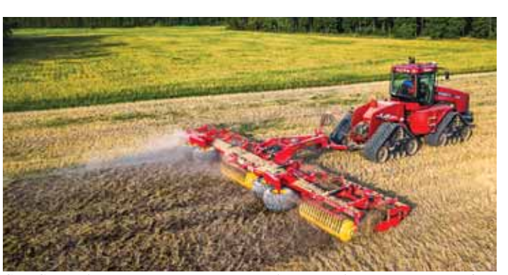
CrossCutter Disc works at a shallow depth, leaving crop residue at or near the surface. Discs are mounted on rubber-suspended arms to closely follow ground contour.

Contact: FARM SHOW Followup, Bud Vogelzang, 13 1/2 3<sup>rd</sup> Ave. S.W., Sioux Center, Iowa 51250 (ph 712 441-1037).