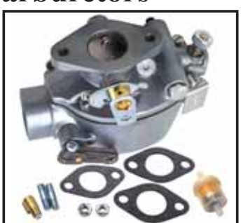
Burrey Carburetor Repair can repair or rebuild almost any tractor carburetor. They specialize in Case, Farmall, Oliver, Ford and Massey Ferguson tractors.

Bleke says all rebuilt models are completely disassembled. Passages are cleaned with drill bits, then glass beaded. Parts are cleaned, polished and painted, then pre-set to OEM specifications. The business can also manufacture just about any part that can't be repaired. All carburetors carry a one-year guarantee and are sold on an exchange basis. Without exchange add a $100 core charge.