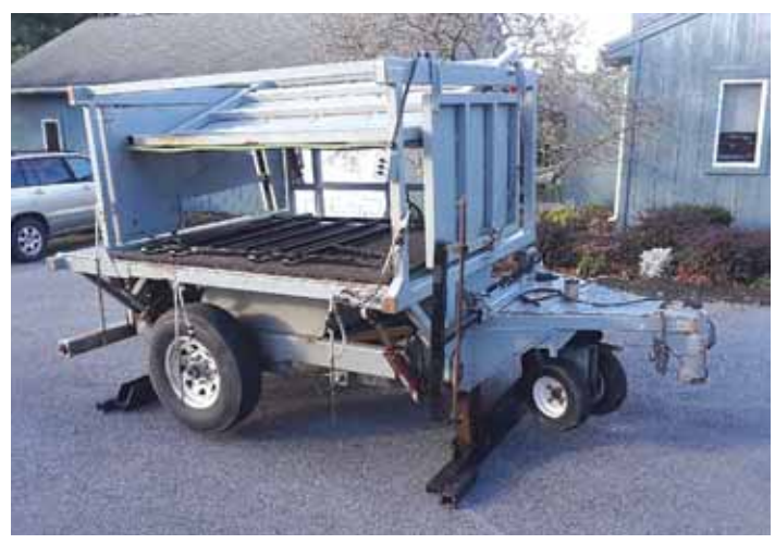
Hydraulic-driven front wheels on self-propelled hoof trimming table make it easy to back into tight spaces. A front jack stand raises wheels off the ground for hooking up unit's gooseneck hitch.