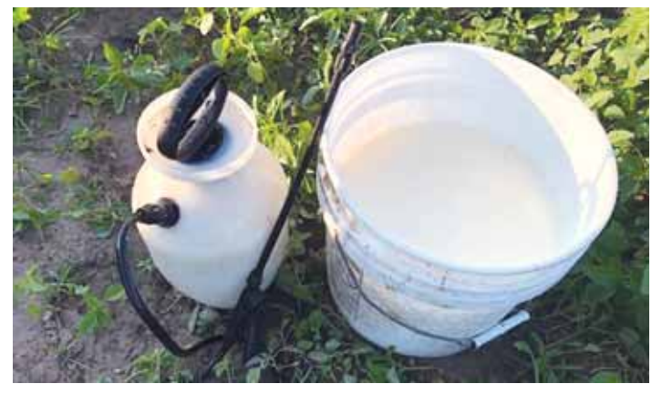
Bernt mixes the raw milk with sodium bicarbonate, and applies it to everything from garden crops to row crops.

Contact: FARM SHOW Followup, Clear Creek Organic Farms, 82228 499th Ave., Spalding, Neb. 68665 (ph 308 750-1086; clearcreekorganicfarm@hotmail.com; www. clearcreekorganicfarm.com).