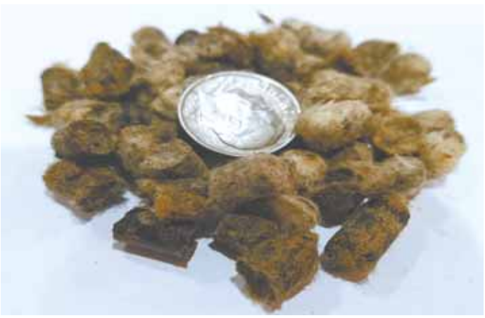
Wool pellets swell with water and release it slowly during dry periods.

The pellets are sold online from Wild Valley Farm and are available at independent gardeners - many of them on the East Coast. "We've found that it's good for everywhere," Albert says, whether the pellets are