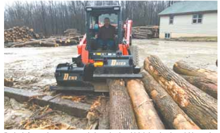
Bucket's 2 grapple arms operate independently, which is handy when picking up logs and other objects.