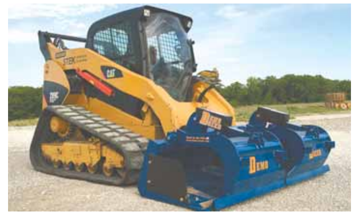
Demo-Dozer skid loader attachment can be used as a dozer, clam bucket, material bucket, log handler, 4-in-1 bucket, receiver hitch, or demolition grapple.