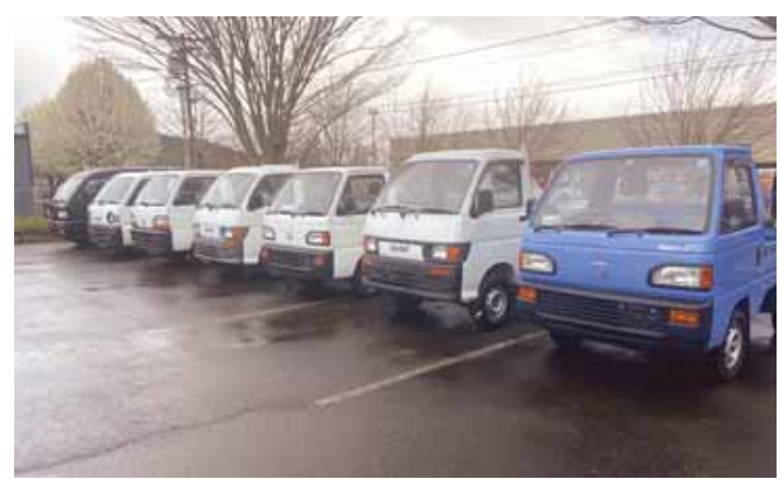
Motorcycle Warehouse carries several brands of mini trucks and camper vans imported from Japan.

Some models are available with an electric/hydraulic-operated dump bed. Examples include the 4-WD Subaru Sambar 550 cc and the Suzuki Carry 660 cc, which sell for