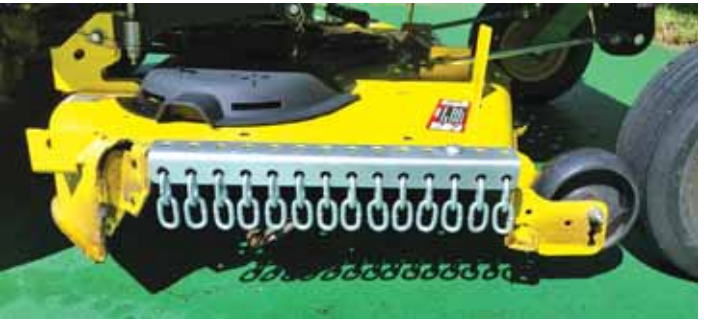
Redesigned chain guard is short enough to avoid dragging or hitting mower blades.

Contact: FARM SHOW Followup, Motorcycle Warehouse, 12115 SE 82<sup>nd</sup> Ave., Portland, Oregon 97086 (ph 503 805-2684; motoman5@gmail.com; www.mcwarehouse.com or www.minitruckwarehouse.com)