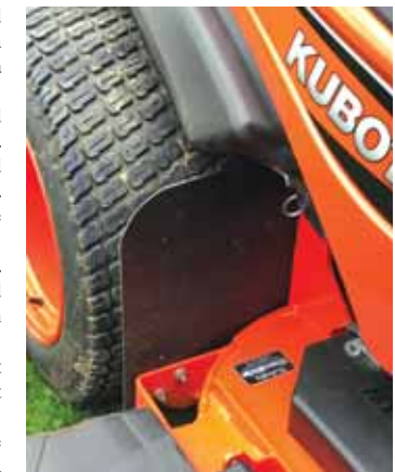
Rubber mud flaps bolt on ahead of mower's rear wheels to keep deck clean.

Contact: FARM SHOW Followup, Steve Tomson, 365 N. Foster Rd., Jackson Center, Pa. 16133.