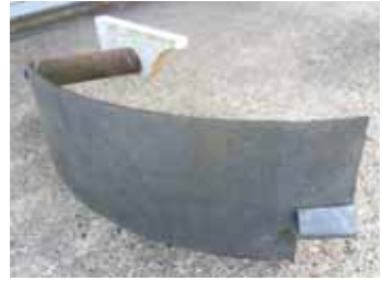
Tabs on steel plate are held in place by mower's spring-loaded discharge chute.