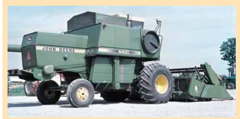
Deere combine before Color Back treatment