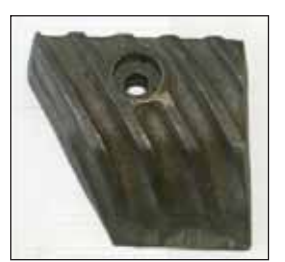
K 506 Kile Thresh Bar