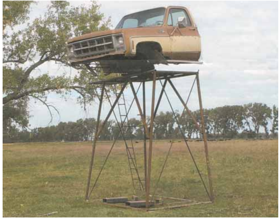
Austin Roney made a rotating deer stand by mounting a pickup cab on top of a metal stand. Cab rotates 360 degrees on a turntable mechanism.

Contact: FARM SHOW Followup, Austin Roney, Oakes, N. Dak. 58474 (ph 701 408-9077; austin.roney@k12.nd.us).