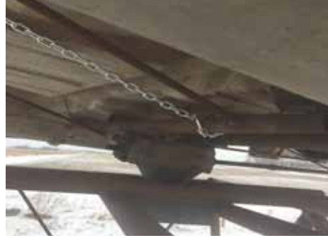
Up to 3 people can sit on the roomy, full-size pickup seat. The end drive gearbox off an old center pivot irrigator serves as the turntable mechanism for the cab.