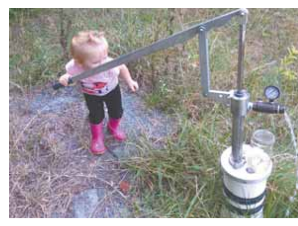
SimplePUMP installs by replacing your well cap with one that has an inlet for drop pipe and sucker rods.

"No well is the same, and no static water level is the same, so we need to talk with customers to properly select and price a