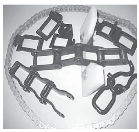
Customers can order chains from the website, from a catalog, or over the phone.