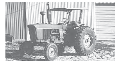
Permanent replacement seals don't leak like factory seals, says Boling Machine.

We also sell load control shafts for most models, 2950, 2940, 2840, 2850, 2855, 2550 and many others. All seals are guaranteed.