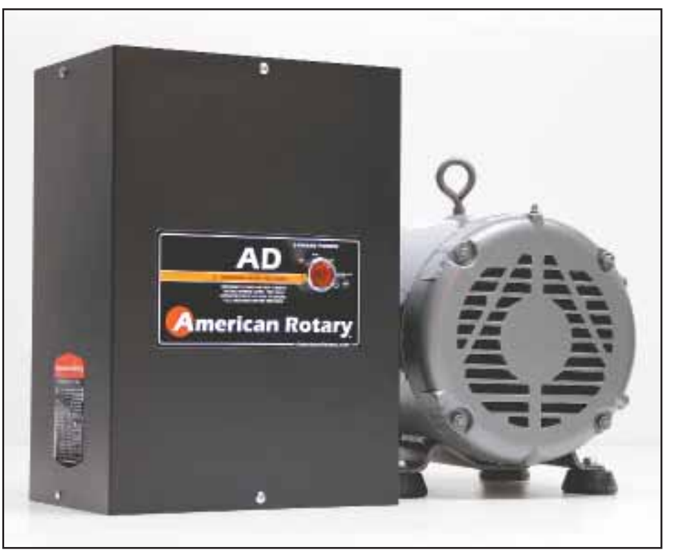
American Rotary's phase converters supply 3-phase power without 3-phase service or cost.

Gentec American Rotary offers a wide variety of phase converters from the AR line for home hobbyists and small businesses to the newly introduced AI industrial line.