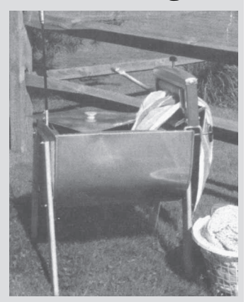
The James Hand Washer can be fitted with a wringer roller at one end.

Contact: FARM SHOW Followup, Lehman's, 289 Kurzen Road North, Dalton, Ohio 44618 (ph 877 438-5346; www. lehmans.com).