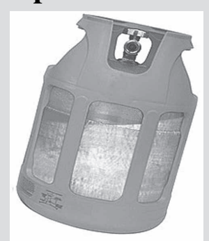
lucent composite material that lets you visibly check the propane level.

Contact: FARM SHOW Followup, The Lite Cylinder Co., 139 Southeast Parkway Ct., Franklin, Tenn. 37064 (ph 866 412 5483; www.litecylinder.com).