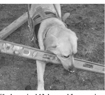
She has paired 13 dogs and farmers since starting the service in 2009.