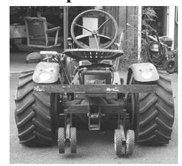
Tom Demers turned an old Panzer garden tractor into a pulling tractor, adding a pair of 10-in. high wheelie bar wheels on back.

so it doesn't look pretty, but 'pretty' doesn't make a tractor pull any better. The Panzer is built heavy, which is why it works so good for pulling. The rear axle was designed for a 3,000-lb. car with a 90 hp engine, so we can put all kinds of power through the rear end without damaging the differential. There's no way you're going to break a car rear end with a 9 hp engine.'