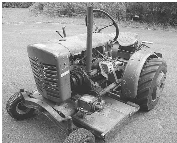
He replaced the Panzer's engine with a 9 hp Kawasaki engine but kept the mower deck, which weighs 150 lbs., for added traction.

Contact: FARM SHOW Followup, Tom Demers, 267 Hard Hill Rd. N., Bethlehem, Conn. 06751 (ph 203 266-6297 or 203 266-5767; tdemers350@hotmail.com).