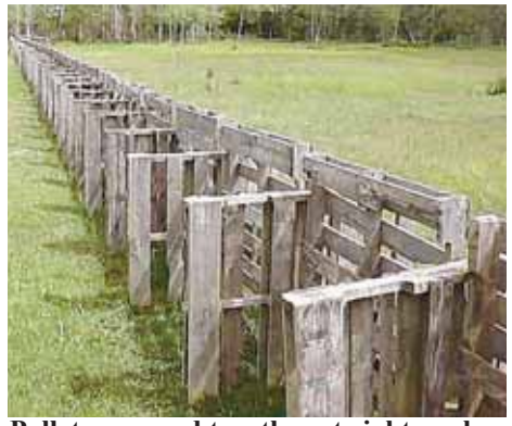
Pallets are used together at right angles.