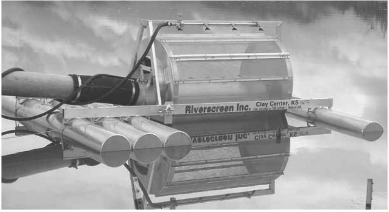
Water-driven, self-cleaning screen is designed to work in water as shallow as 4 in.

Even though she lives in a high rainfall area, Biondo says the 5-year-old fence is still solid and shows little signs of rot.