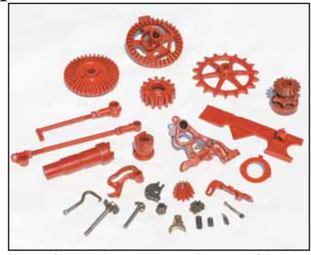
Knotter frame and components are just some of the many replacement parts General Repair makes for McCormick binders.

new sprockets, chains, cutter sections and other parts that were worn out," he says.