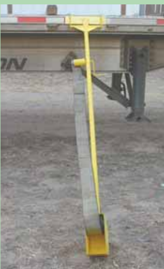
Strap-A-Pult pole throws trailer straps over big loads.