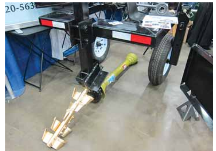
Twister Trencher consists of a pto-driven hardened shaft fitted with a series of cutting blades that penetrate dry, hard-packed soil.