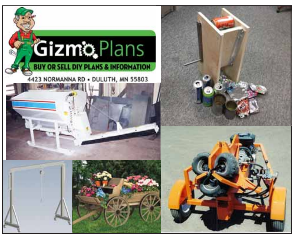
Got plans to sell? GizmoPlans.com makes it easy to tell the world!