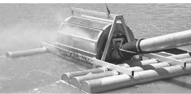
Water-driven, self-cleaning screen is designed to work in water as shallow as 4 in.

"It draws water that's only 2 in. below the surface, which is usually the cleanest water," says Wietharn. "It draws water from seven times the area of the suction line. You can draw from shallower water if you're pulling it from a bigger area, because the the water moves more slowly."