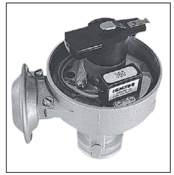
Electronic breakerless ignition system replaces points and condensers on old tractors.

Best of all, there are no points that require