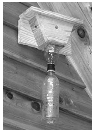
Carpenter bees enter through holes in small wooden house and soon head toward a plastic soda bottle below, where they become trapped.

When the first bees get trapped they die inside the trap. The dead bees release a pheromone that attracts more bees to the trap. The bees have a nesting season where the males hover and fight. The females drill holes and lay eggs in the wood, this time of year. The male bee has a yellow dot on his head and cannot sting. The female bee has a solid black head and can sting. So if you put your finger up in the hole she can sting you. Early in the year the bees looking for nest sites are easily trapped. Later when the bees are taking care of larva in the wood,