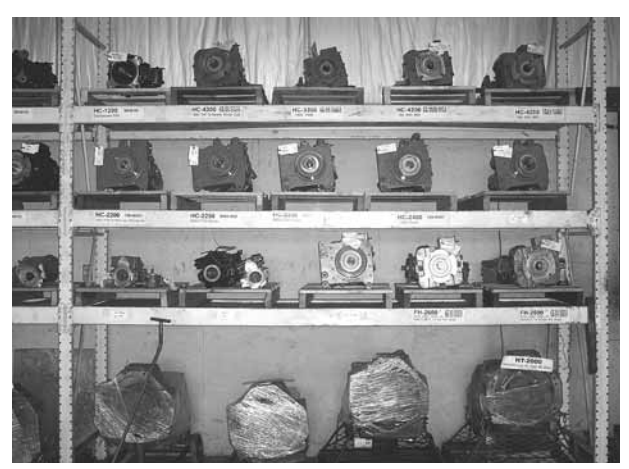
Herrs Machine has been rebuilding hydraulic pumps and hydrostatic transmissions since 1969.

and valves. All remanufactured units come with a warranty.