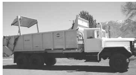
Boyce Equipment of Ogden, Utah buys and sells WWII and Korean War equipment as well as newer stuff. A manure spreader was added to this military truck.