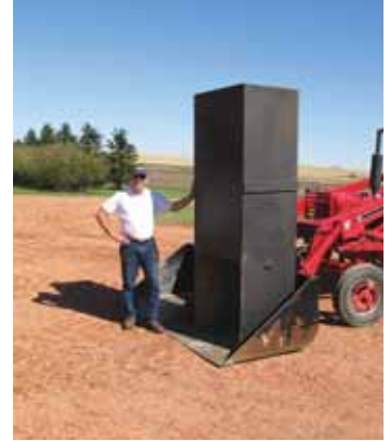
"It eliminates a lot of sunflower dust and tailings from being pulled in around the engine," says inventor Chester Schantz.

Schantz's wife Bonnie says the black box has attracted a lot of media attention, including a story in The Sunflower Magazine,