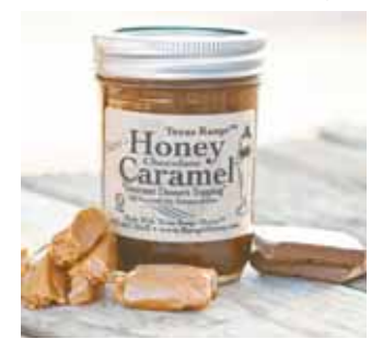
Texas Range Honey sells a variety of unique flavors, including caramel honey.

Range Honey also offers creamed honeys, made by a controlled crystallization process that results in honey that spreads like