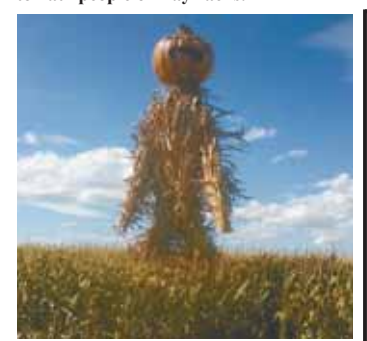
Pumpkin-headed landmarks - two 22 1/2-ft. tall ones and three smaller ones - greet visitors.