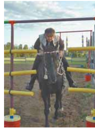
Horse "toys" include big exercise balls for playing soccer and other games (left), "squeeze chute" tunnels made with foam noodles (right), and a 3-ft. sq. pedestal.