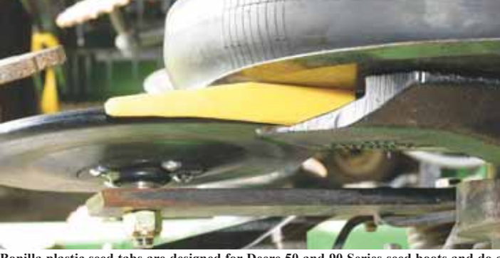
Bonilla plastic seed tabs are designed for Deere 50 and 90 Series seed boots and do a better job of keeping seeds from bouncing out of seed slots, says the company. Fabs Put Seeds Into Slot