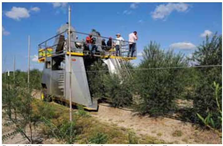
Georgia Olive Farms co-op buys olives for processing and also offers turnkey programs for new growers. Last year's crop was picked with a modified blueberry harvester.

"Olives were a new crop for me" says Shaw. "We grow cotton, peanuts and corn. Olives take a different mindset, and we haven't figured everything out yet. People