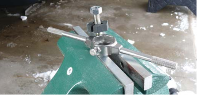
Thread Chaser tool comes with a hinged die that wraps around the damaged bolt. A T-bar handle is used to quickly restore the threads.

"We continue to introduce new sets and are