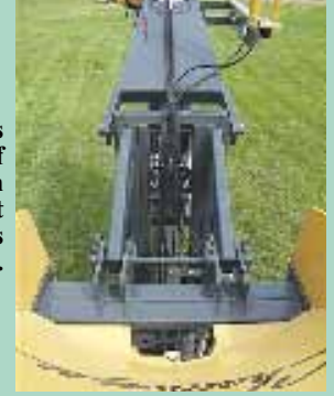
Photo shows closeup of quick-tach receiver bracket that makes hookup easy.

A new quick-tach receiver bracket provides easy hookup in 10 to 15 min. using a hitch pin and C-clips to mount the Tile Pro to your tractor. Using the quick-tach bracket to hook up to the frame of the tractor—and not the 3-point hitch—gives the Tile Pro better stability for grade than a standard pulltype plow. Mounting the Tile Pro into your hitch and the quick-tach bracket, mounted high on your tractor, increases traction by the even trasfer of weight to the front and rear of your tractor. It also allows for increased maneuverability because there are no tires to move around or back over the starting point as with a pull-type. The side of the low angle knife is lined with stainless steel for less resistance and drag as it opens the ground to allow the boot to glide through