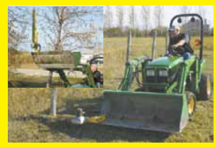
Hydraulic-powered cutter attaches to loader