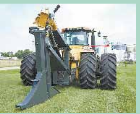
Interchangeable boots mount on quick-tach tile plow by simply pulling a single rod.