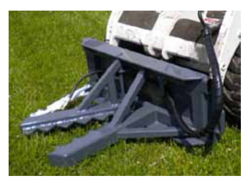
New: TreePuller Timberline Tree & Post Puller