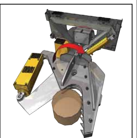
With the push of a button, Timberline<sup>™</sup> Tree Shears rotate up to 110 degrees from horizontal.