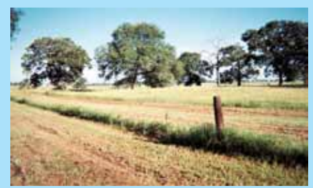
Fence line before cutting