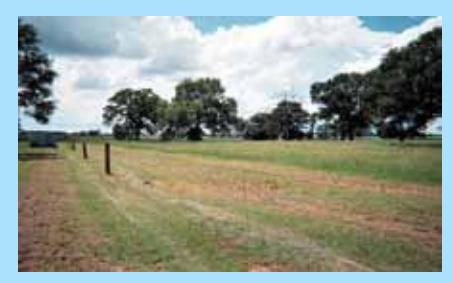
Fence line after cutting

The Fence Mower is a heavily-constructed tractor implement that mows under fence lines and maneuvers around fence posts as the operator drives parallel to the fence row.