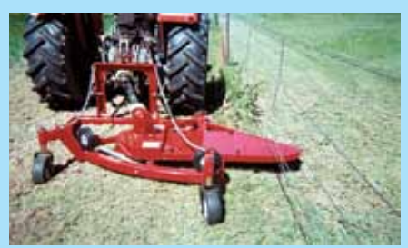
FM 60 Fence Mower