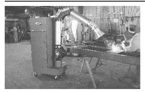
Air cleaner rides on four caster wheels. Suction arm on front draws dirty air into the unit before it has a chance to get out into shop.