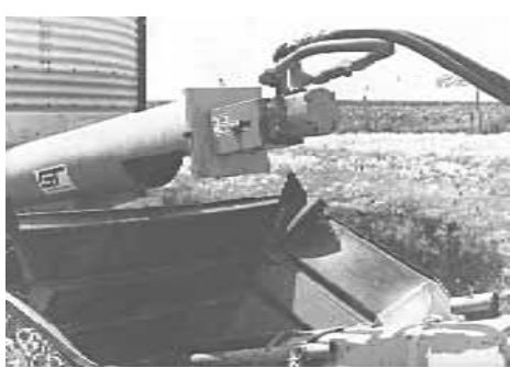
Hydraulic drive easily installs on most any existing unloading auger without removing the bearing.

Contact: Hydra Fold Auger, Inc., 931N 1600 E Rd., Loda, Ill. 60948 (ph & fax 217 379-2614 or hydrafoldauger@illicom.net).