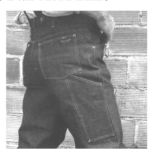
Pedee Jeans are designed to last twice as long as regular commercial jeans, thanks to their lock stitch construction and reinforced stress areas.

"We have four main jean styles - a full cut, heavy duty work jean, a double-thick front jean, a street jean, and a safety jean with a receiver cup for your Kevlar ballistic pad in the front panel. Another popular item is their