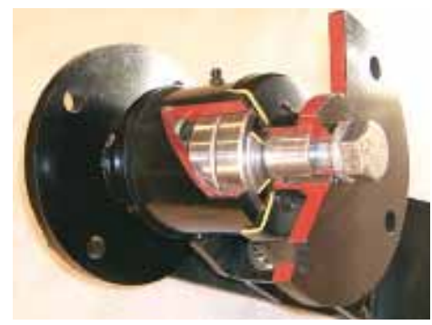
Coulter kit includes 18-in. 13-wave boron "earthenharden" coulter blades, left. Kit, right, is now fitted with 4 bearings to make it even more heavy-duty. Works in wheat stubble and corn stalks. Cuts up trash so you can plant days earlier.