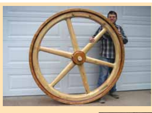
Gary Martin makes models for castings, ranging from miniature parts for antique tractor collectors to man-sized steam engine flywheels.

"My students are using their new skills to make antique car parts, wood plane and lathe parts, steam engines and other projects," says Martin. "Most classes meet once a week for ten weeks, but I am considering an intensive one week workshop if enough people are interested."