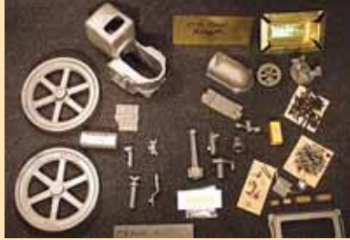
He teaches pattern making through a local col-lege and privately to individuals in his shop.

Contact: FARM SHOW Followup, Martin Model & Pattern, P.O. Box 19792, Portland, Ore. 97280 (ph 503 329-8949: garv@martinmodel.com: www.martinmodel.com).