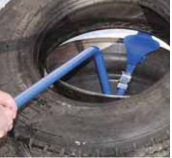
It works because of the patented shape of the tool's head, and the leverage that you get from the handle.