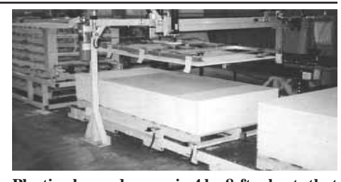
Plastic plywood comes in 4 by 8-ft. sheets that can be used like wood.

Plastic Plywood: No painting required but paint can be applied without peeling or chipping because the board is waterproof. Sheets range from 3/8 inch to 1-1/8 in. thick. Plastic Plywood is readily available in 4 ft.